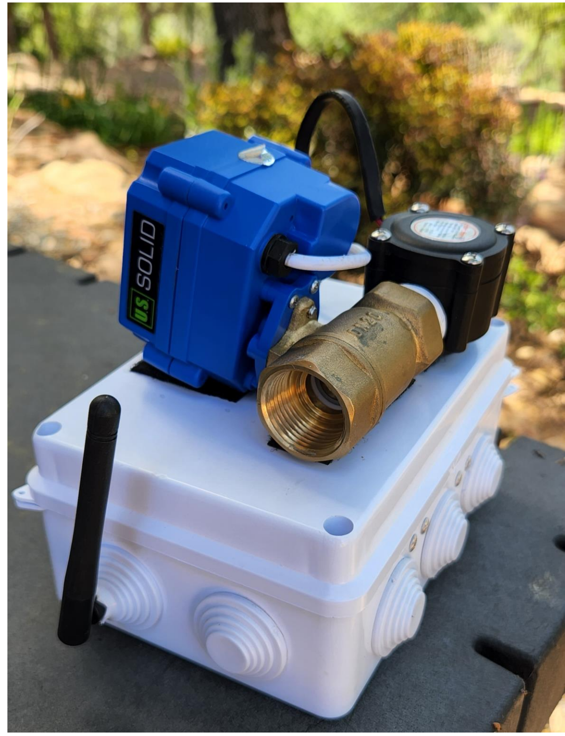
Figure 3. Remote Control Kit [3]

The design of our system is to save freshwater resources. As it currently is applied, it is designed to decrease the costs associated with residential water use. We expect that this system would be applicable to larger industrial settings where freshwater consumption is much higher.